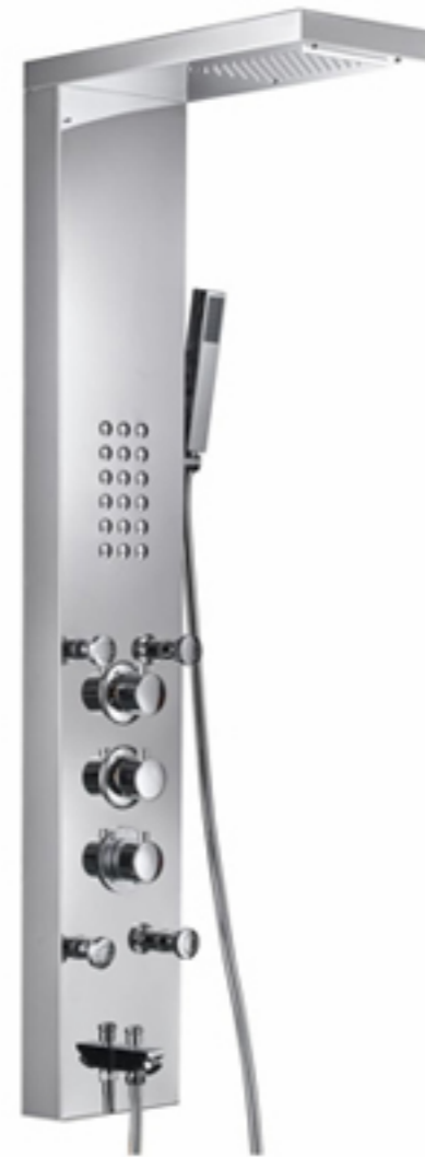
LY114-02m material:stainless steel