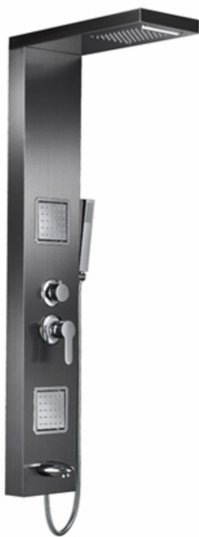
LY110-02B material:stainless steel