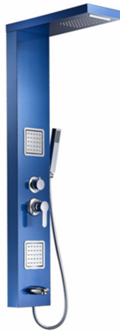
LY110-03b material:stainless steel