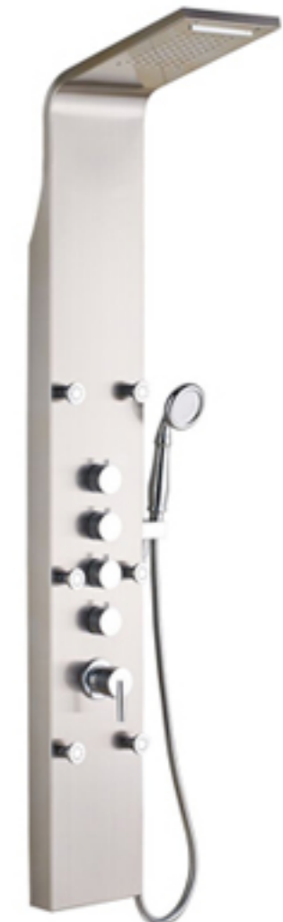
LY106-01S material:stainless steel