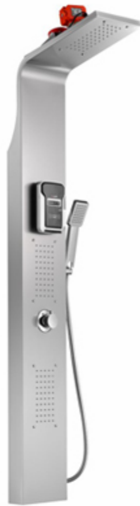
LY118-01N material:stainless steel