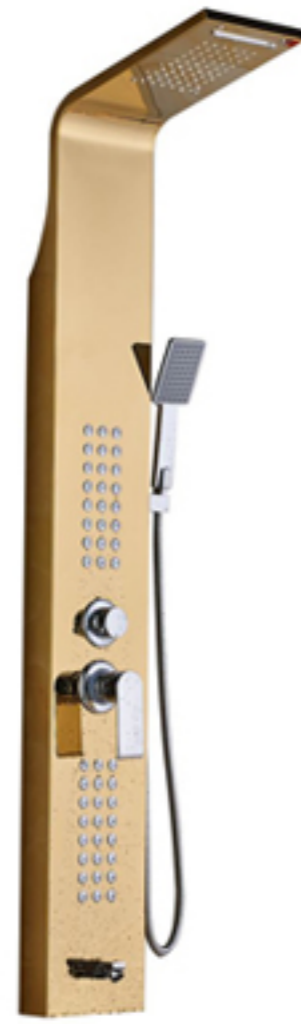
LY107-01G material:stainless steel