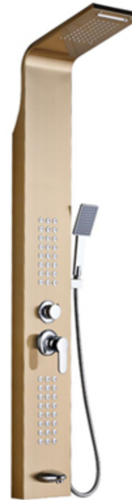
LY101-01GN material:stainless steel