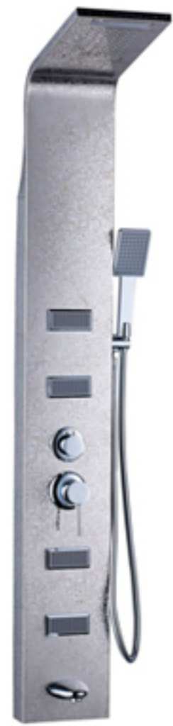
LY108-01C material:stainless steel