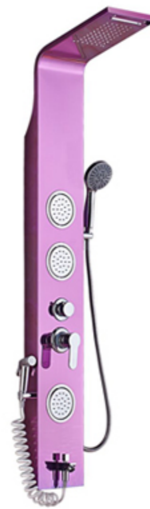
LY102-01P material:stainless steel