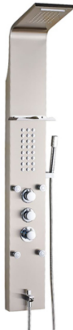
LY100-02N material:stainless steel