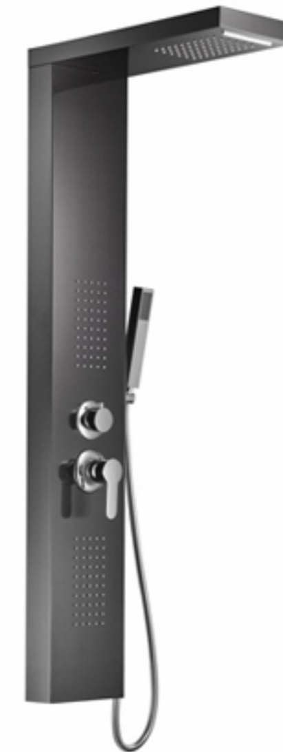
LY115-03B material:stainless steel