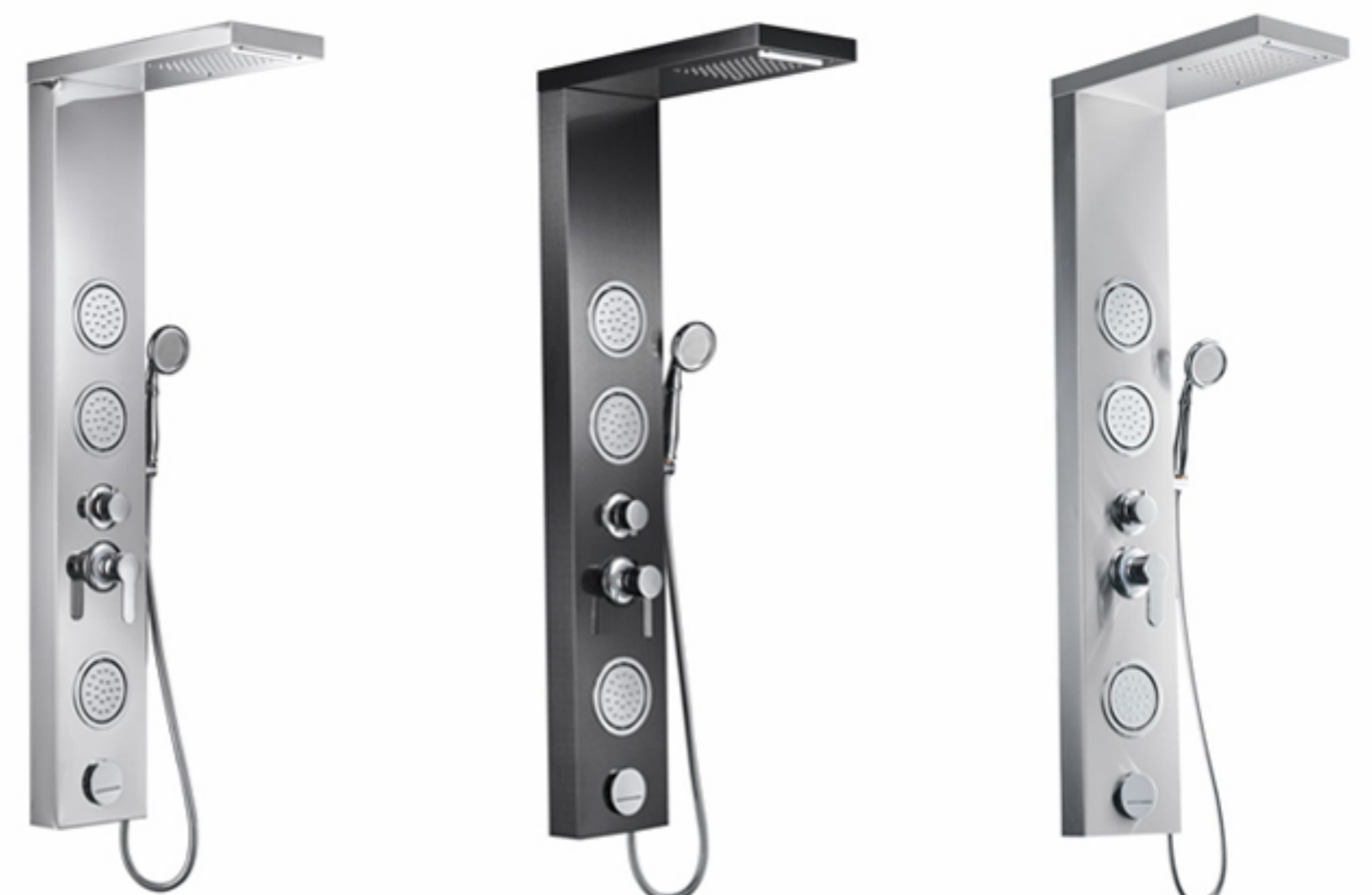
LY112-01S material:stainless steel