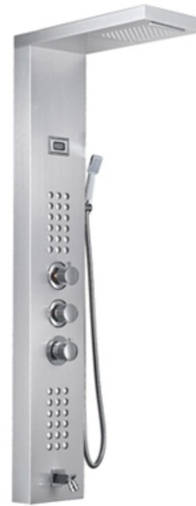
LY116-01N material:stainless steel