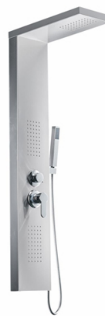
LY115-01S material:stainless steel