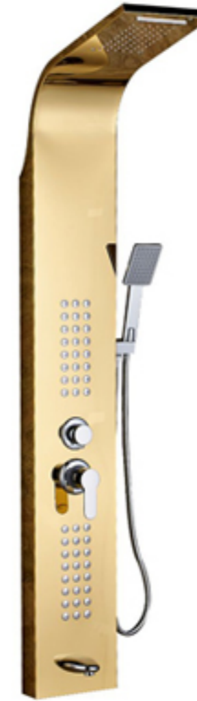
LY101-02G material:stainless steel