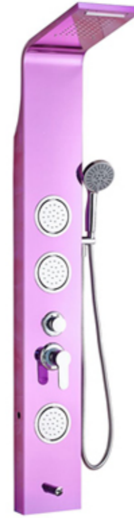
LY105-01P material:stainless steel