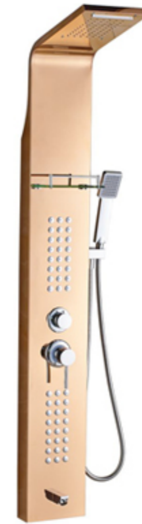
LY104-01R material:stainless steel