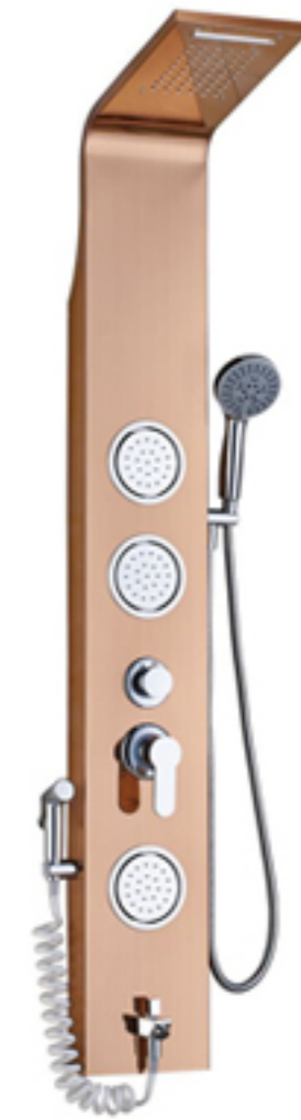
LY102-03R material:stainless steel