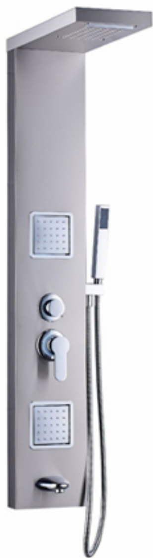
LY110-01S material:stainless steel