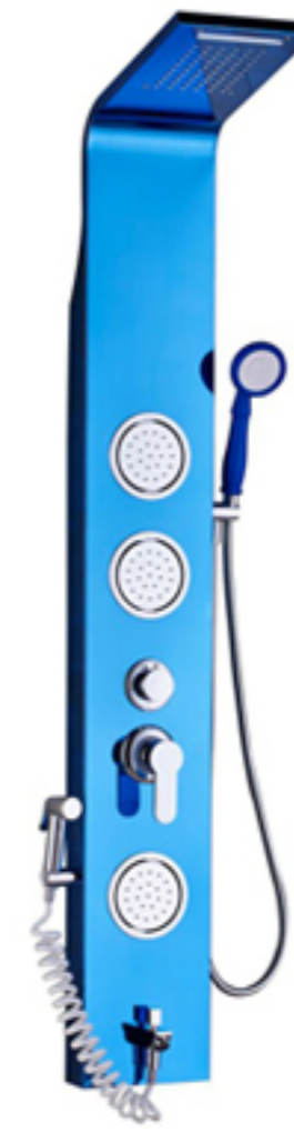
LY102-02b material:stainless steel