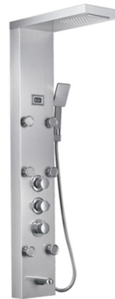
LY117-01N material:stainless steel