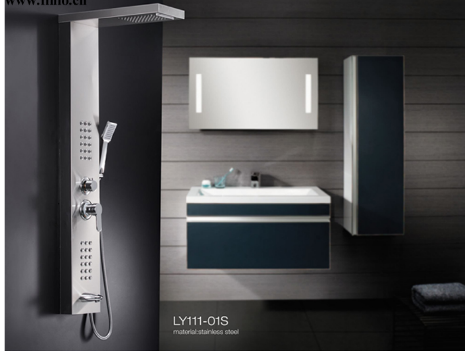
LY111-01S material:stainless steel