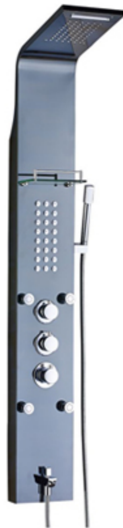
LY100-01B material:stainless steel