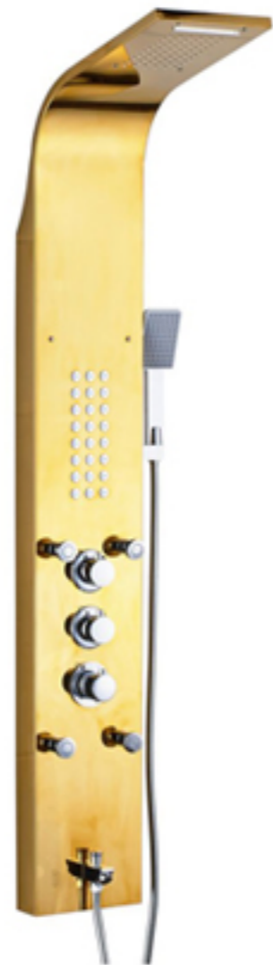
LY100-03G material:stainless steel