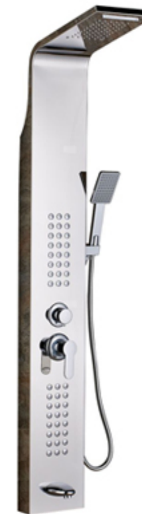
LY101-03M material:stainless steel