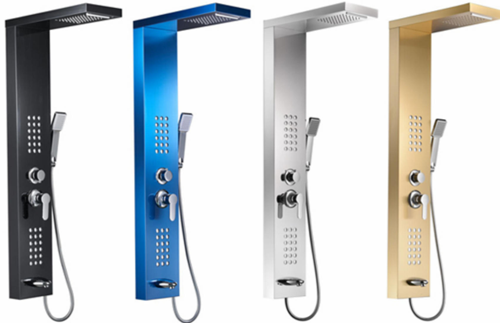
LY111-02B material:stainless steel