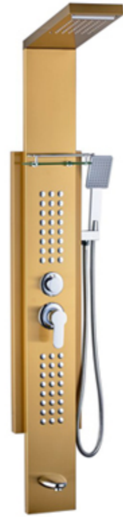
LY109-01GN material:stainless steel