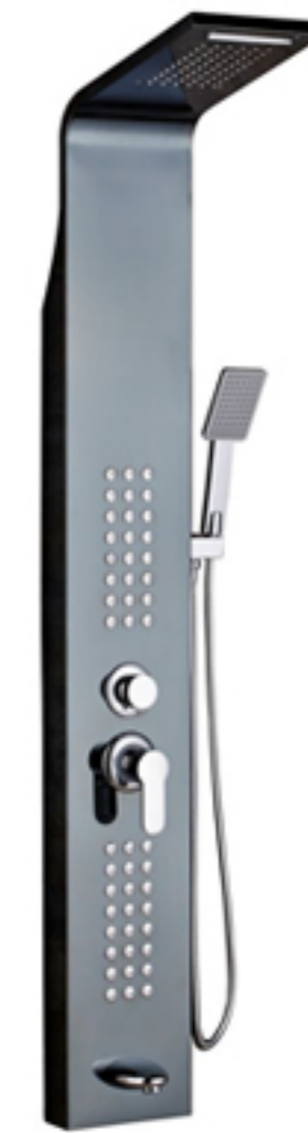
LY101-04B material:stainless steel