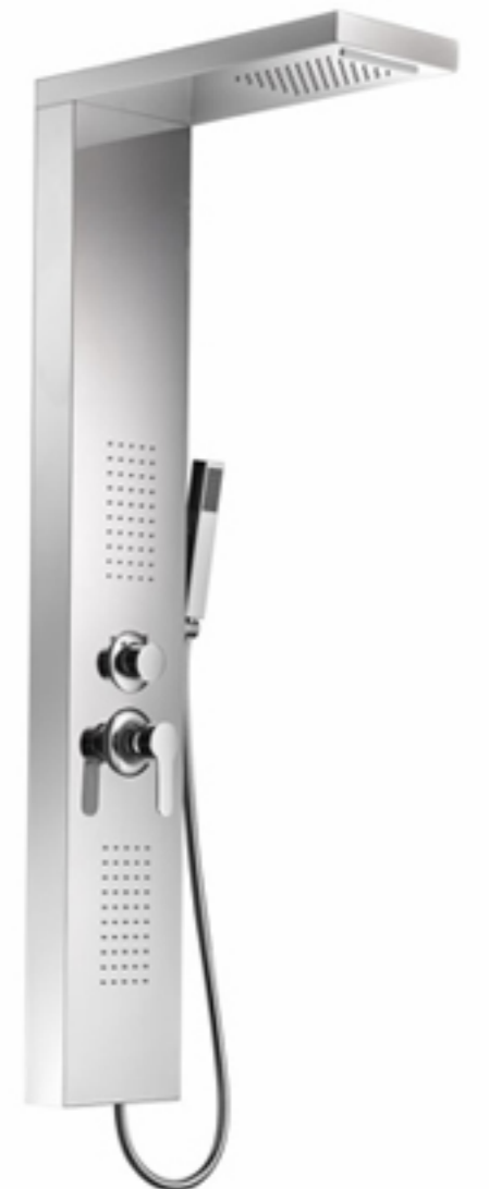
LY115-04m material:stainless steel