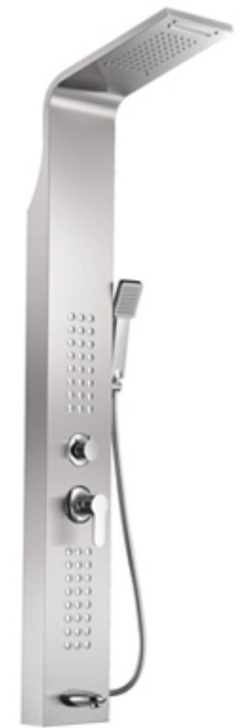
LY101-05S material:stainless steel