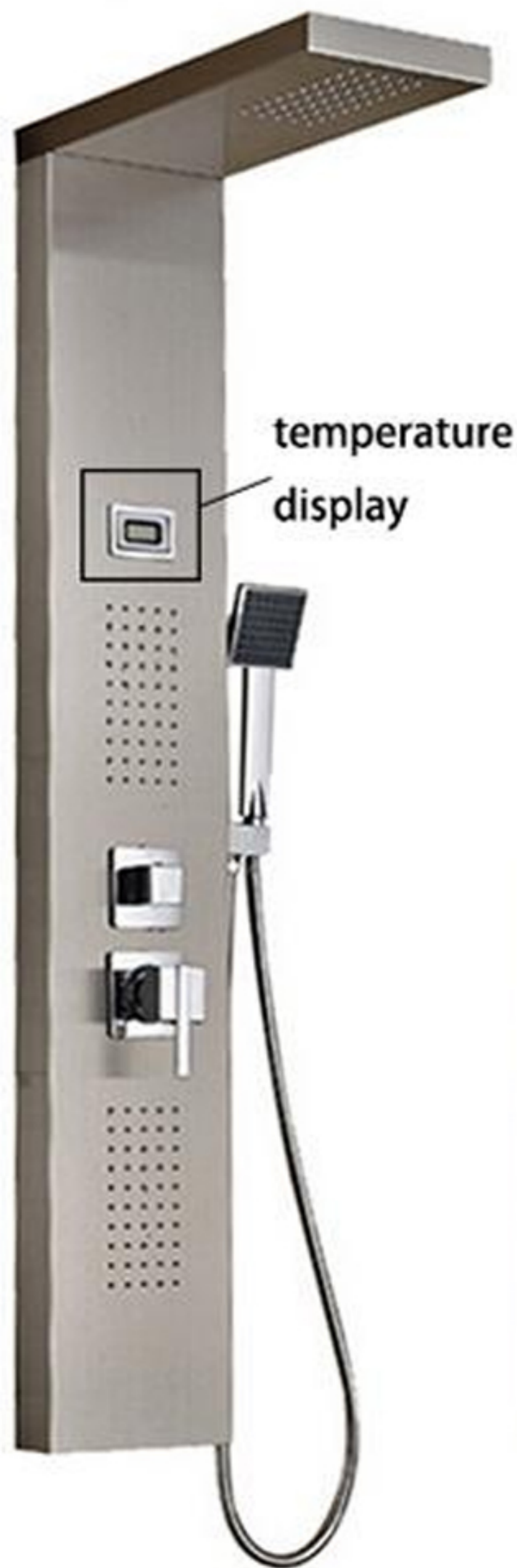
with temperature display