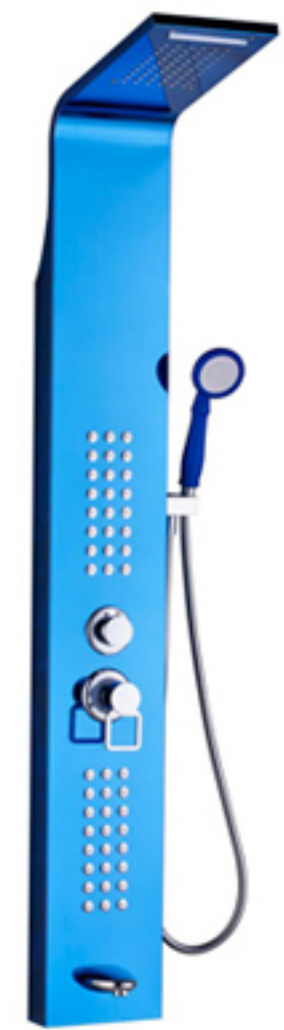
LY103-01b material:stainless steel