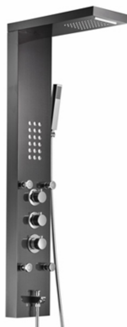
LY114-03B material:stainless steel