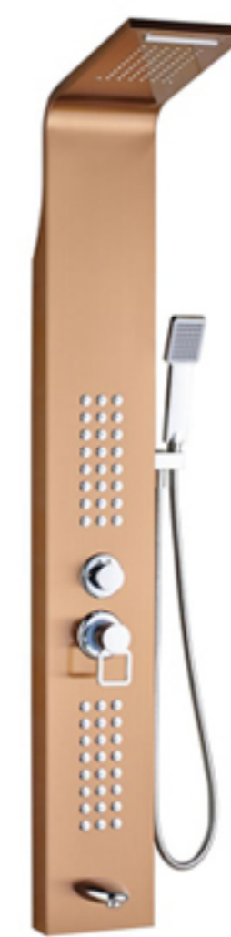
LY103-02R material:stainless steel