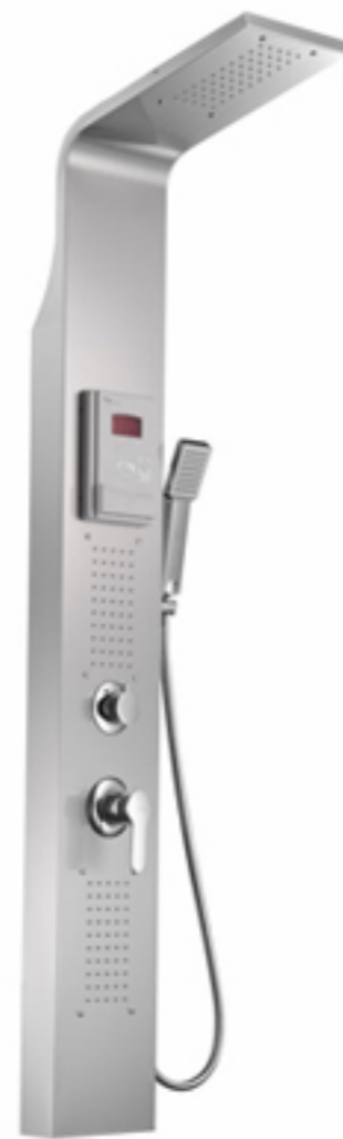
LY119-01N material:stainless steel