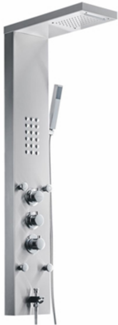
LY114-01S material:stainless steel