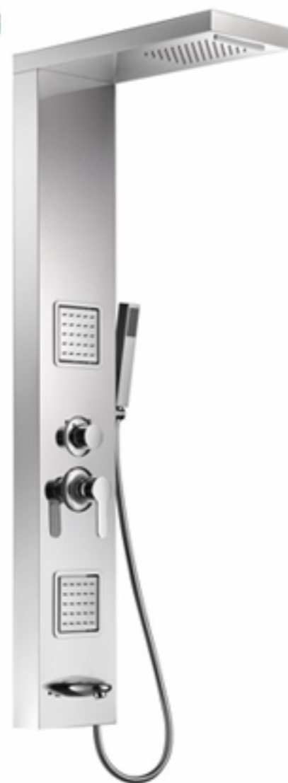
LY110-04m material:stainless steel